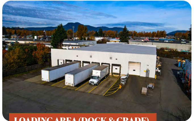
LOADING AREA (DOCK & GRADE)