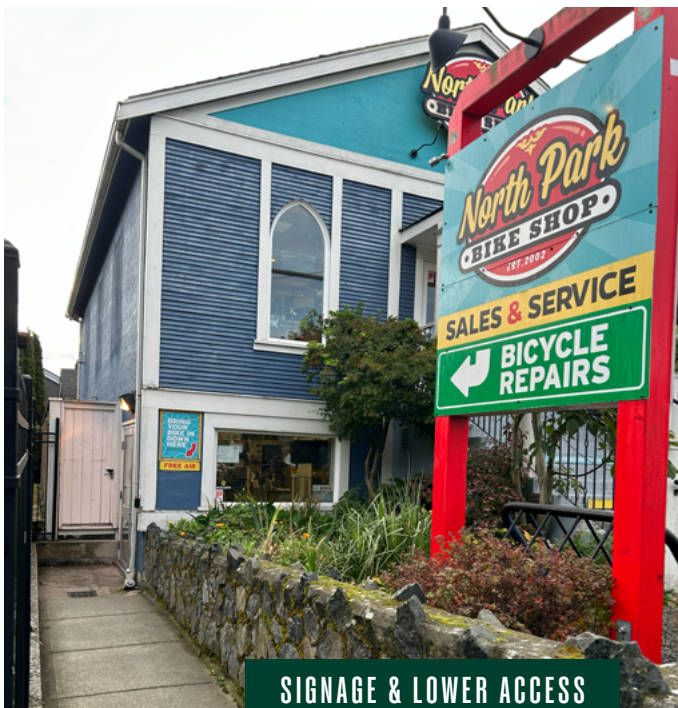
SIGNAGE & LOWER ACCESS