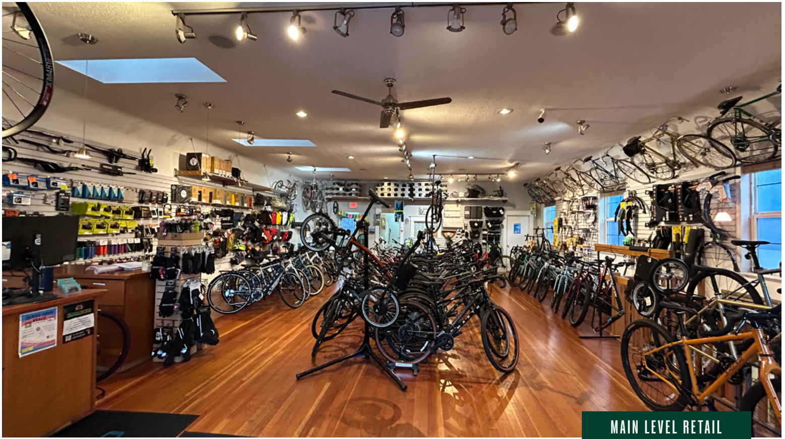
MAIN LEVEL RETAIL