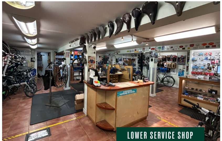
LOWER SERVICE SHOP