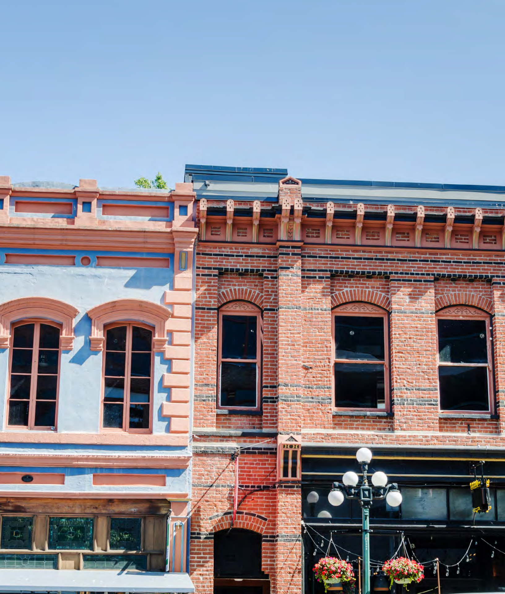
554 Yates Street | Victoria, BC