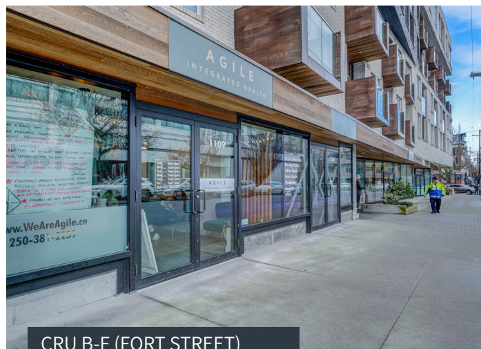
CRU B-F (FORT STREET)