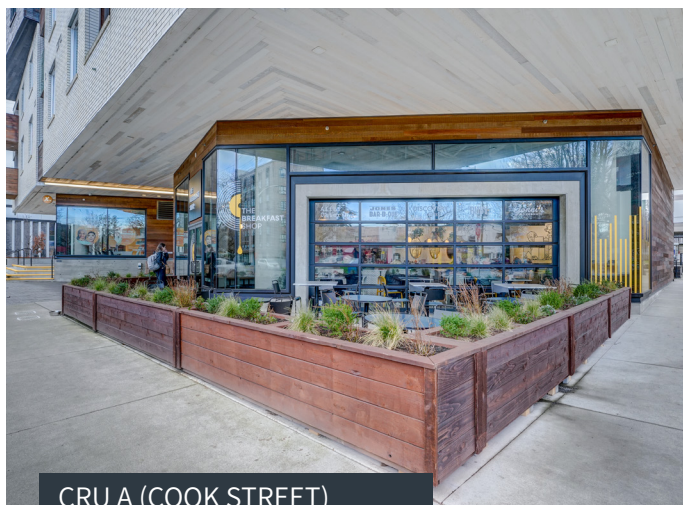
CRU A (COOK STREET)