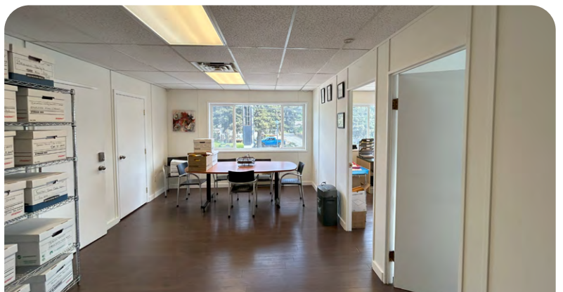
OFFICE SPACE (TENANTED)