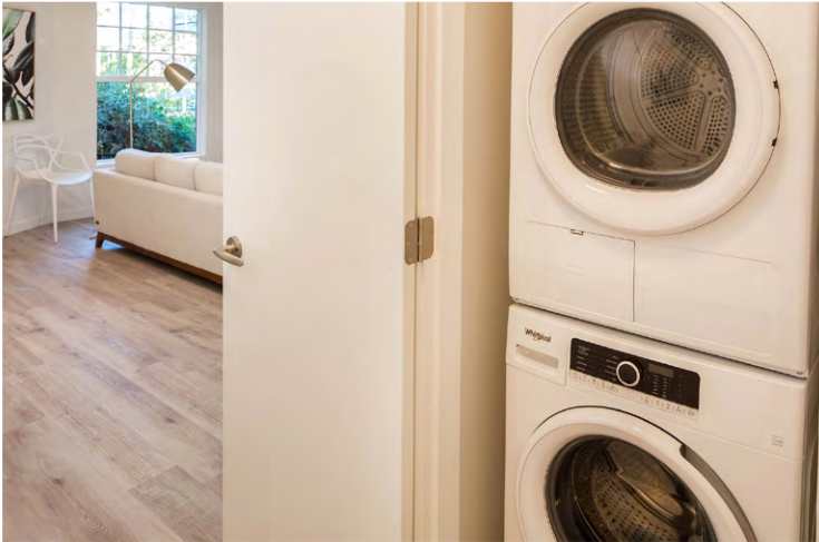
IN SUITE LAUNDRY