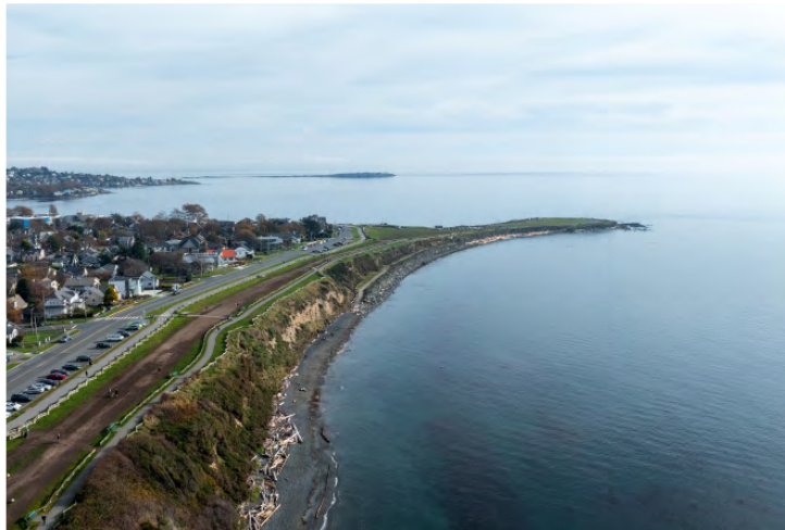
DALLAS ROAD BEACH