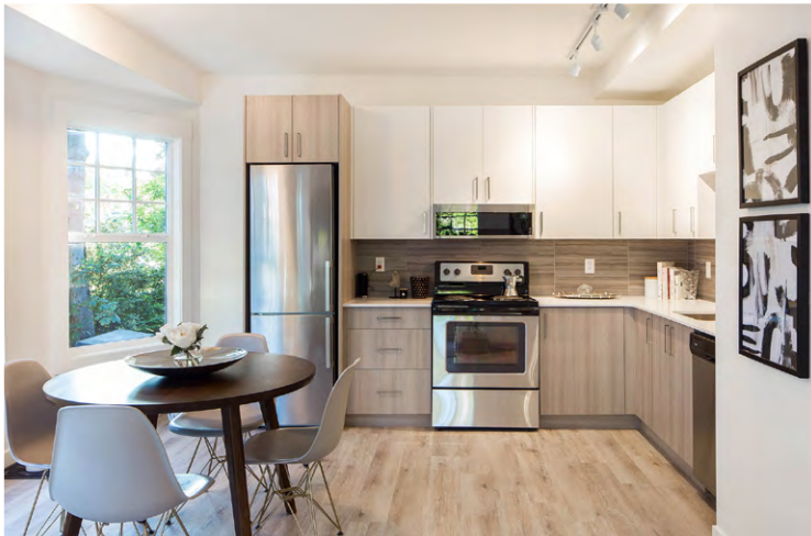
SUITE - KITCHEN