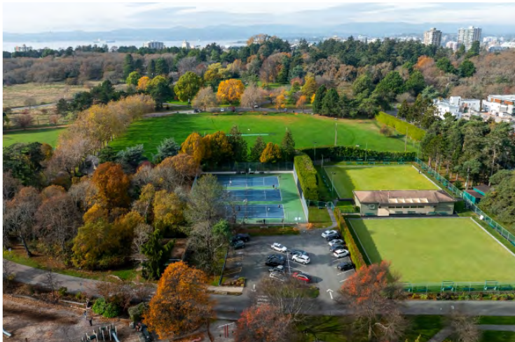
BEACON HILL PARK