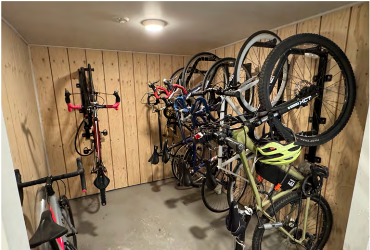
COMMON AREA - SECURE BIKE STORAGE