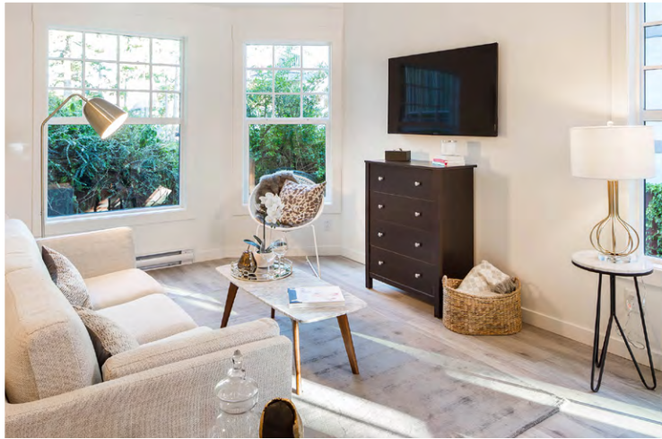
SUITE - LIVING ROOM