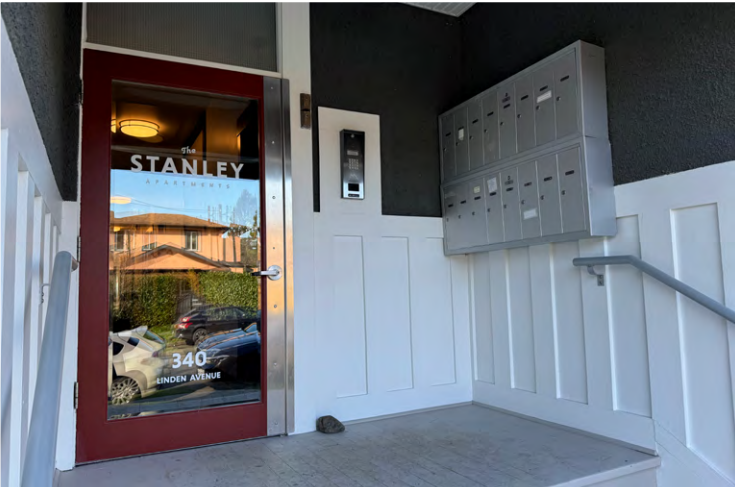
COMMON AREA - FRONT ENTRANCE