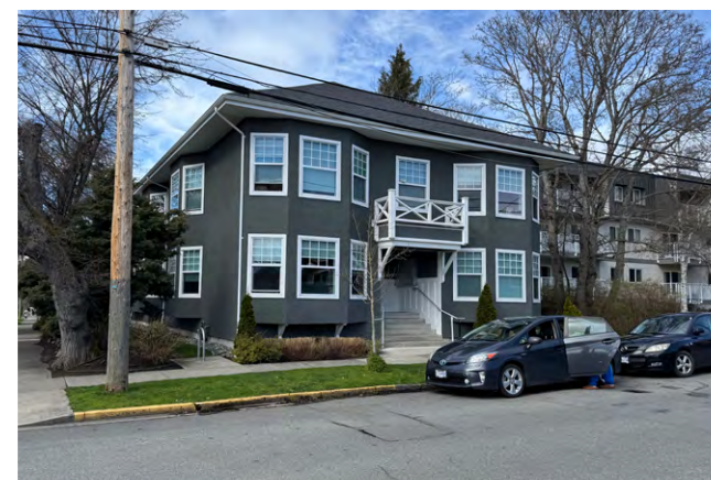
FRONT OF BUILDING ON LINDEN AVENUE