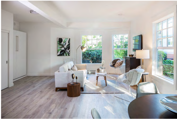
SUITE - LIVING AREA