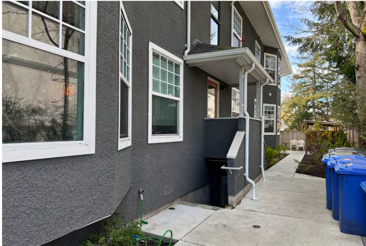
COMMON AREA - SIDE ENTRANCE