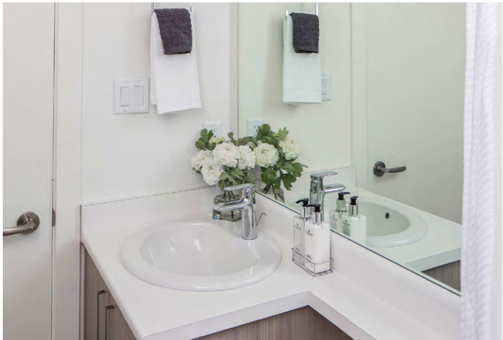
SUITE - BATHROOM