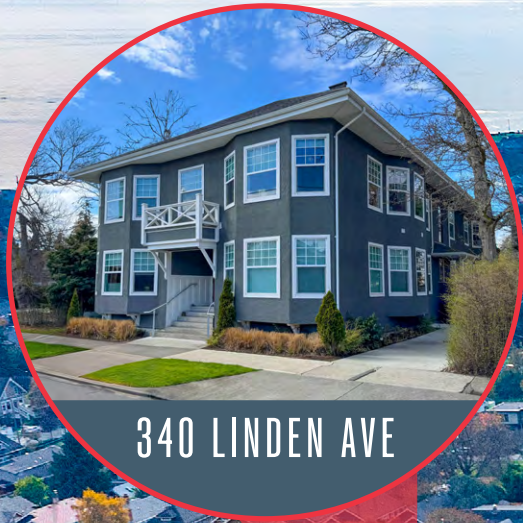
340 LINDEN AVE