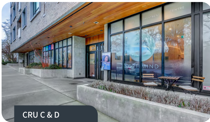
CRU C & D