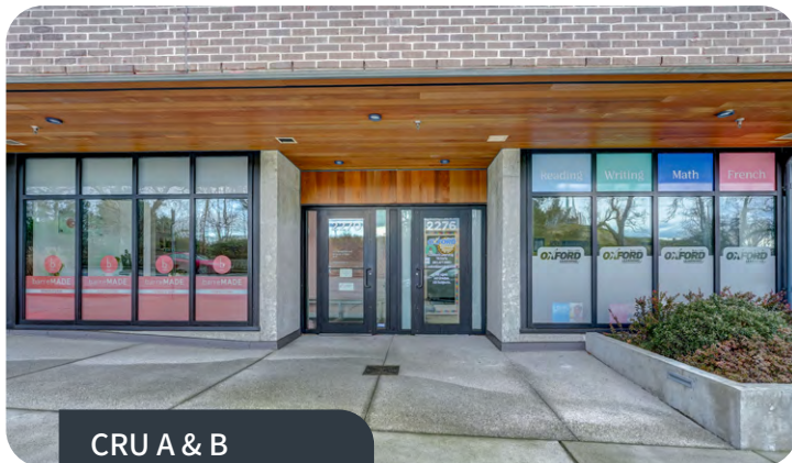
CRU A & B

2020 6 Under Building Parking Stalls CD3 - Bowker Village $5,379,000 (2024 Total)