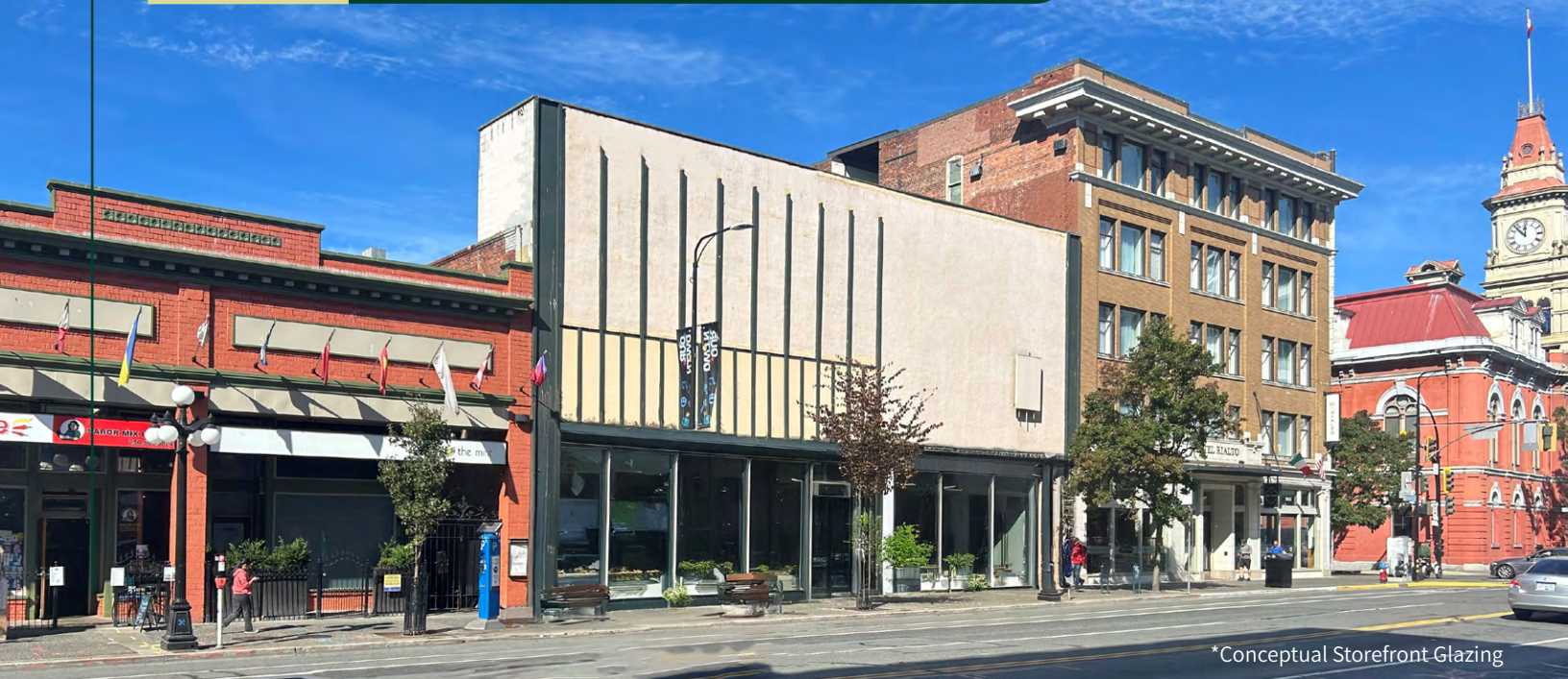
*Conceptual Storefront Glazing