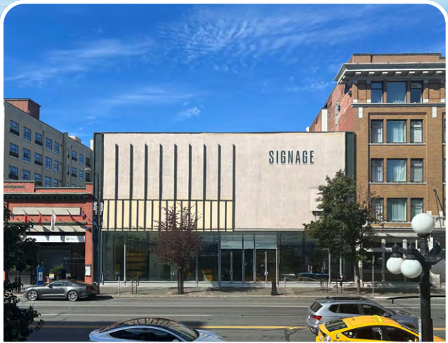
1420 Douglas Street