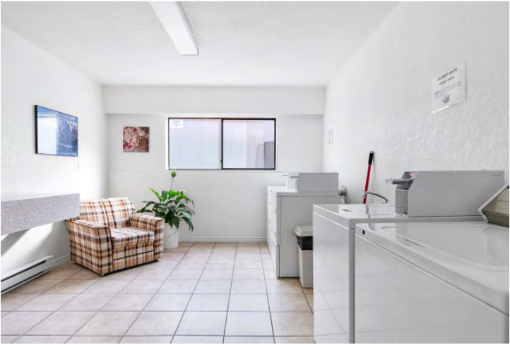
COMMON AREA - LAUNDRY