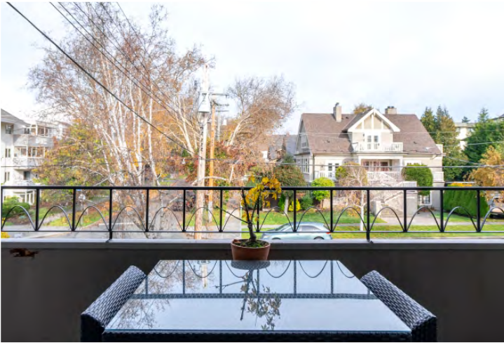
SUITE - BALCONY