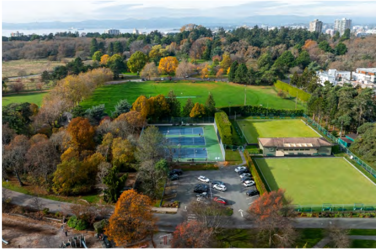
BEACON HILL PARK