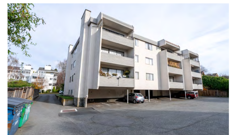
BACK OF BUILDING / PARKING