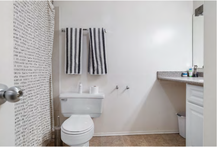
SUITE - BATHROOM