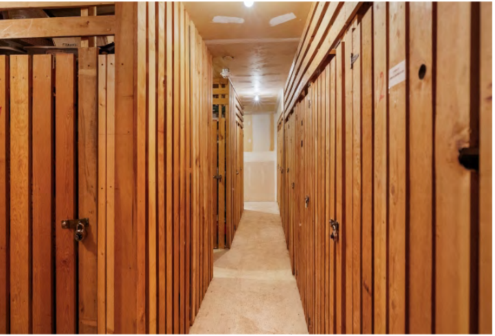
COMMON AREA - STORAGE