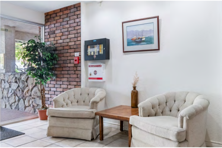
COMMON AREA - LOBBY