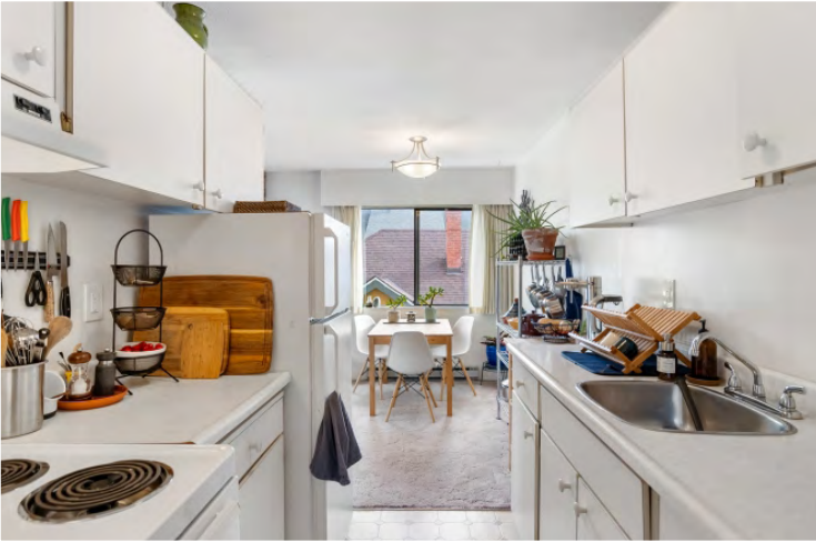
SUITE - KITCHEN