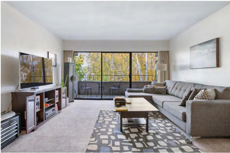
SUITE - LIVING ROOM