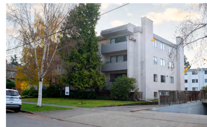
WEST SIDE OF BUILDING