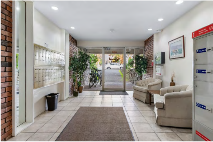
COMMON AREA - LOBBY