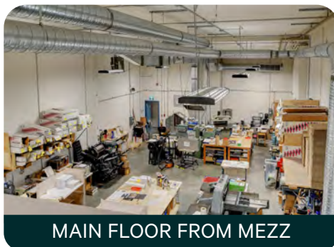
MAIN FLOOR FROM MEZZ