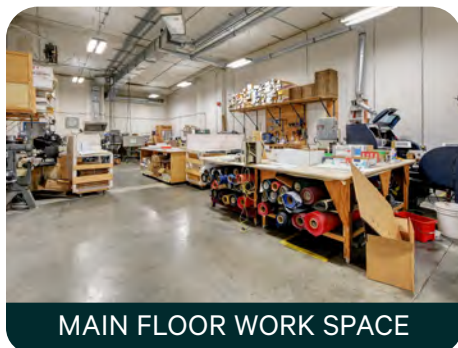
MAIN FLOOR WORK SPACE