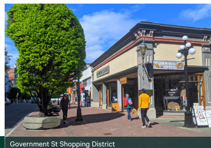
Government St Shopping District