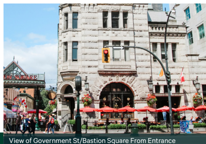
View of Government St/Bastion Square From Entrance