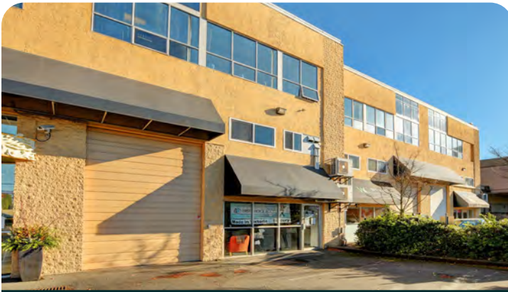
FRONT OF UNIT / PARKING