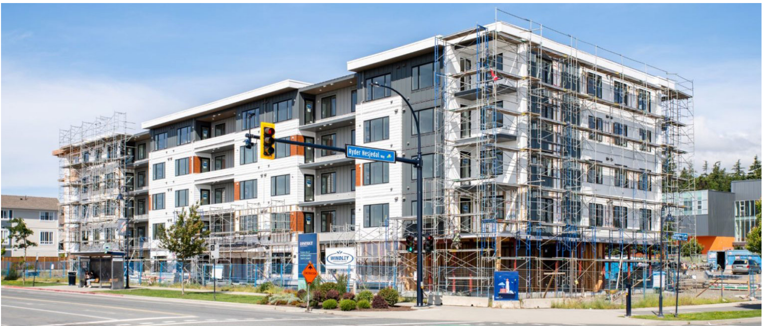
Construction Expected to be Completed Q2, 2023

Corner Retail Space For Lease in Royal Bay 3554 Ryder Hesjedal Way | Colwood, BC