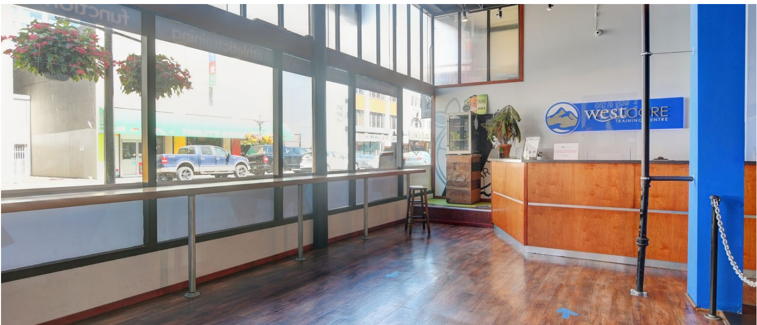
Street Level View From Lower Johnson St