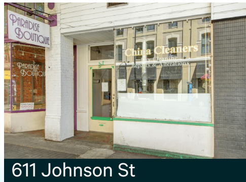
611 Johnson St