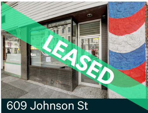
609 Johnson St

One Remaining Boutique Johnson St Retail Opportunity for Lease