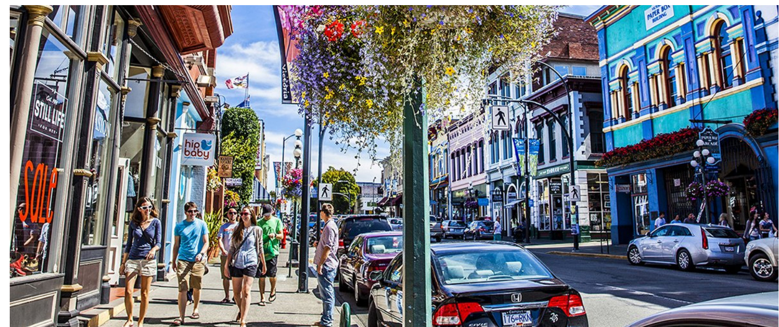
Street Level View From Lower Johnson St