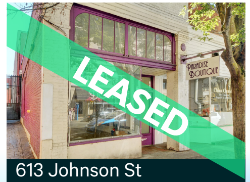
613 Johnson St