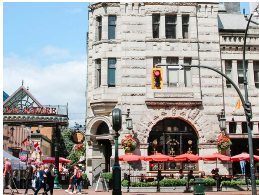
Government St/Bastion Square