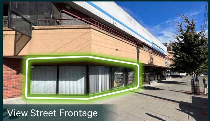
View Street Frontage