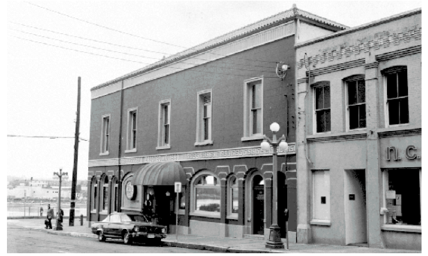
Oddfellows Club - Fort & Wharf Street - 1974

The Odd Fellows Hall (500 Fort St) is a three-storey, stucco-clad masonry building located at the Northeast corner of Fort and Wharf streets in the heart of Victoria's Old Town. It features a distinctive Italianate ground floor arcade. The extension to the North, originally one storey high, has an addition of two floors. This building is a key part of a group of 1860s buildings once known as Commercial Row.