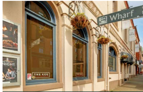
Exterior View From Wharf St