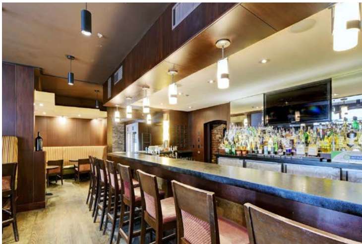
Lounge & Bar