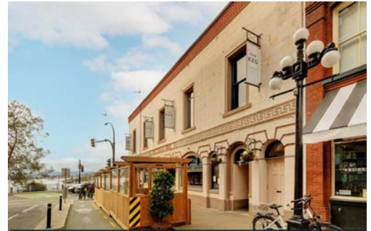
Exterior View From Fort St