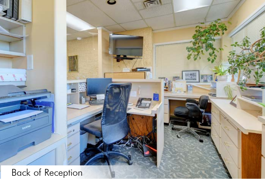
Back of Reception