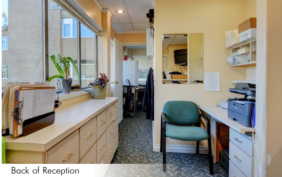
Back of Reception