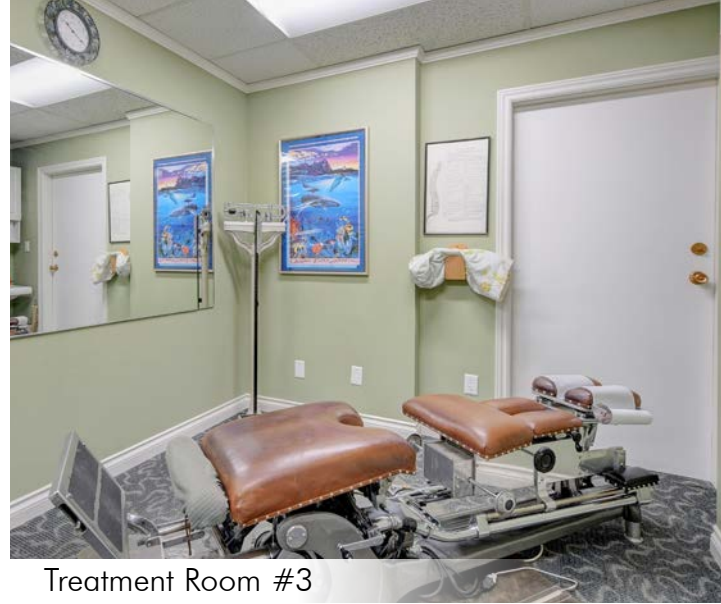
Treatment Room #3