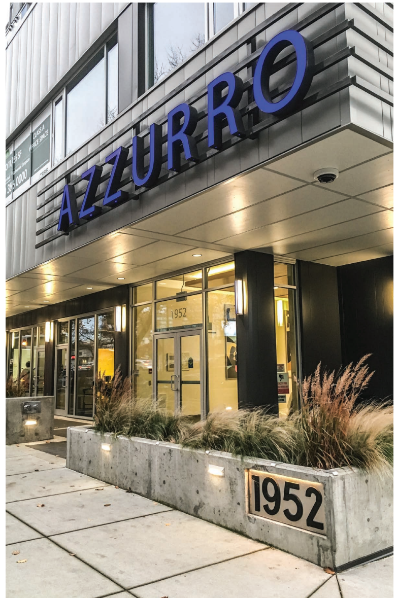
1952 Blanshard Street