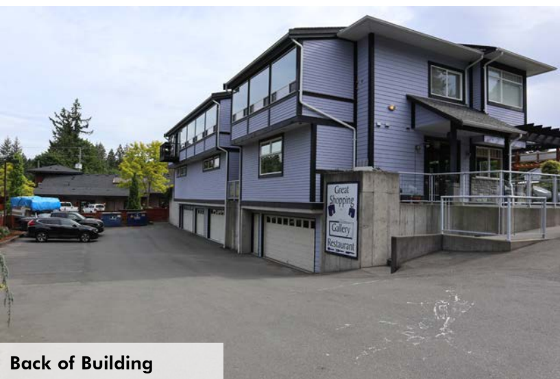
Back of Building