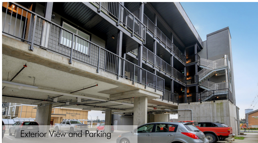
Exterior View and Parking