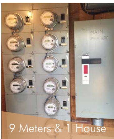
9 Meters & 1 House