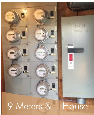
9 Meters & 1 House