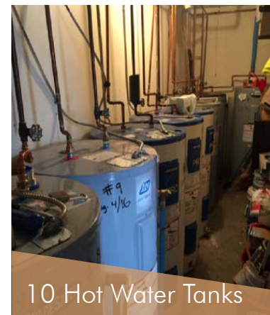
10 Hot Water Tanks