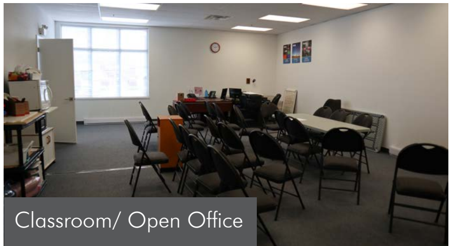
Classroom/ Open Office