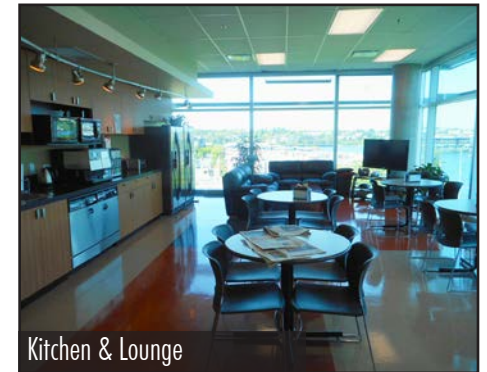
Kitchen & Lounge