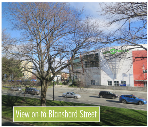
View on to Blanshard Street